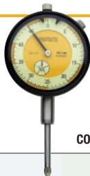
Code No. 7402261