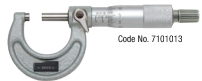
Code No. 7101013