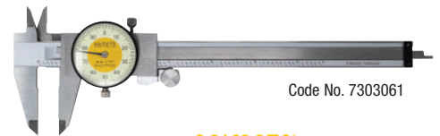
Code No. 7303061