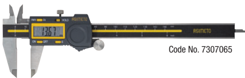
Code No. 7307065