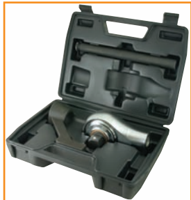
Includes blow mold case.