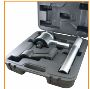
Includes blow mold case.