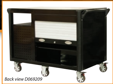
Back view D069209