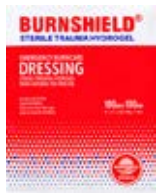
First Aid Burn Dressing 4 x 4 square SB#80-02672