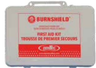
Burnshield® Emergency Burn First Aid Kit 36 Unit #80-1692-0 SB#80-04908