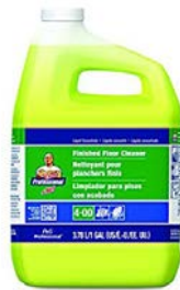
Mr. Clean Heavy Duty Floor Cleaner 4 Litre SB#85-00434