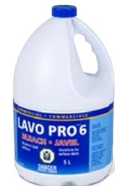
Bleach 5% 4 Litre SB#68-43716