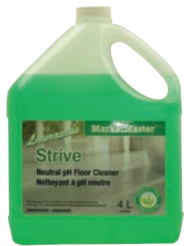
Neutral Ph Cleaner For Hard Floors 4 Litre SB#85-00196