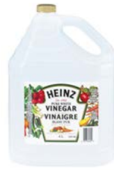
5% Vinegar 4L, White SB#68-43717